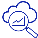
Risk Exposure and Mitigation