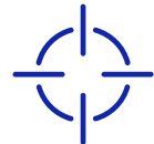
Attack Identification and Response

Average cost of an Active Directory breach: $6.3 million*